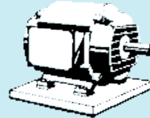
UNISORB ISOLATION PADS